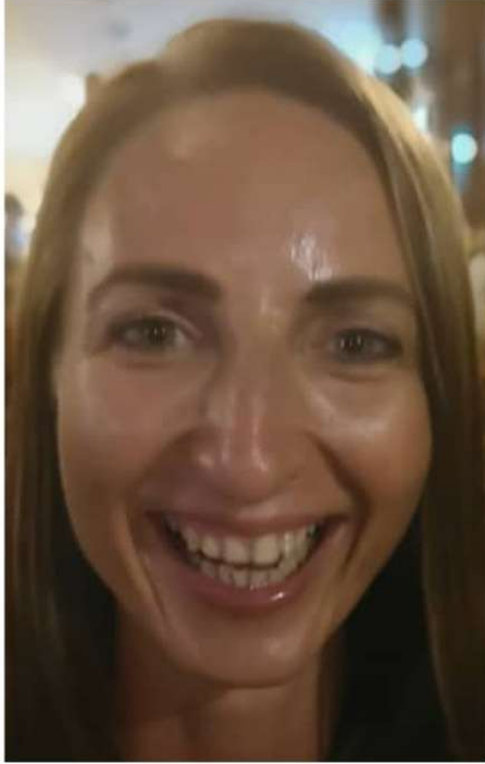
BEFORE TREASURE CELL LIFE